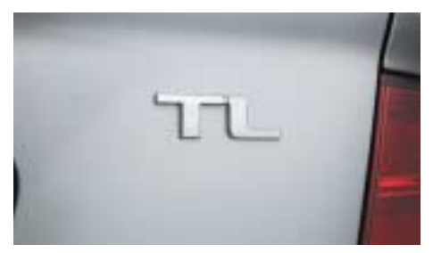
The 2004 TL is now available at the Acura Centre, 655 Circle Drive East in Saskatoon.

Brian, when he's not managing the Acura dealership, is a car enthusiast. He summed up the latest TL. "It has always been a luxurious car. Now it is back to being a performance car as well!"